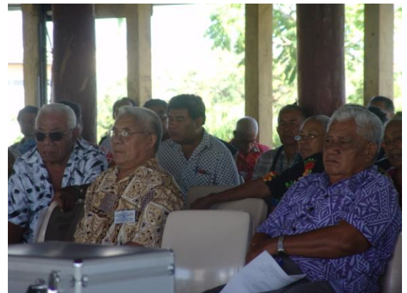
Upolu Pulenuu Consultation