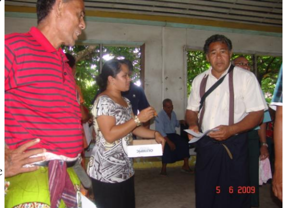
Distribution of Questionnaires at Savaii Pulenuu Consultation