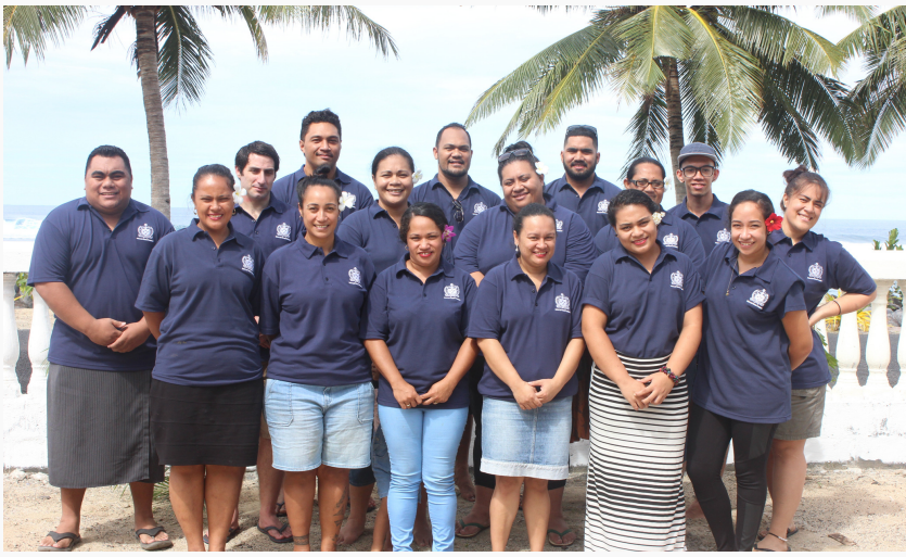
Sex Offenders' Register Office Awareness Workshop 5 - 6 May 2017 at Saleapaga Sands