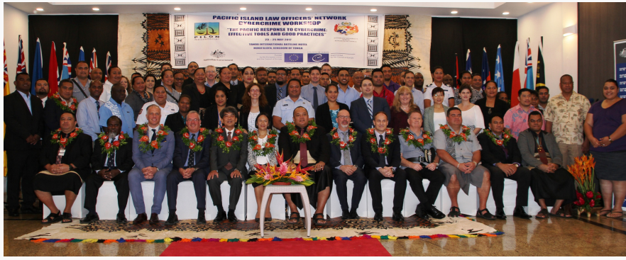
PILON Regional Workshop on Cyber-crime and Electronic Evidence - Nukualofa, Tonga