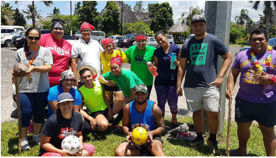
National Health Week SLRC Sports Day - 10 November 2017