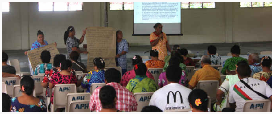
Tina & Tamaita'i Group 2 presenting their findings during the SLRC Drugs Reform Savaii public consultations - 28 Sept 2017, Sapapalii.